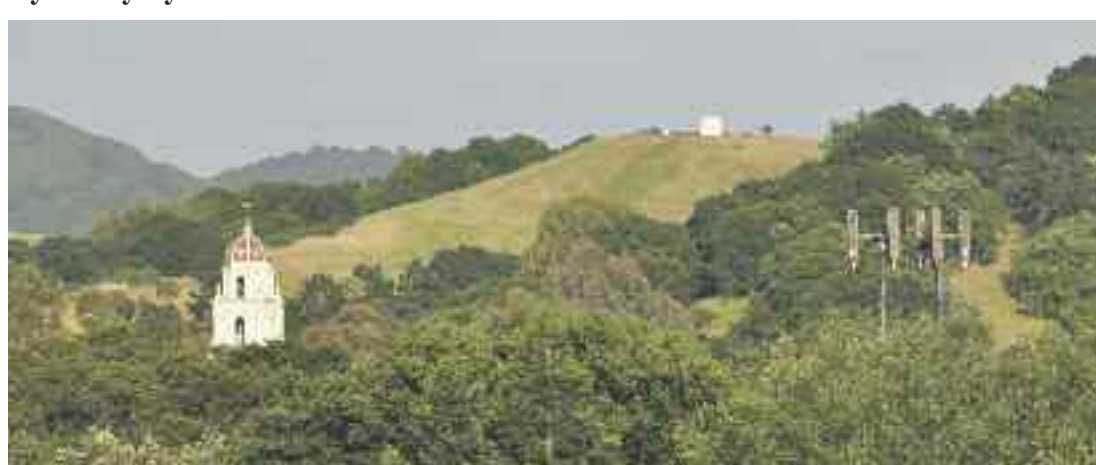
Antenna tower at Saint Mary's College as seen from the Lafayette-Moraga trail.